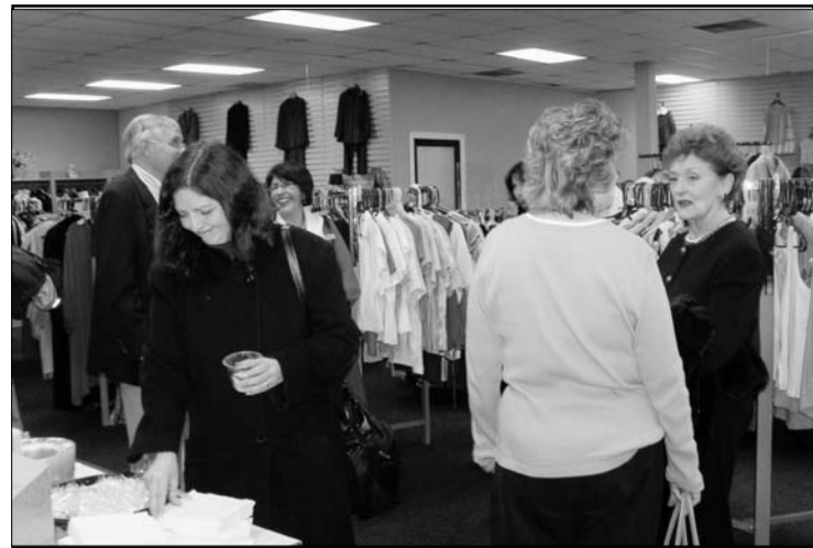
The Silver Lining Store is officially open. The new thrift store will assist El Centro in providing social service programs to Johnson and Wyandotte county residents.

Dream Act and two years ago I was down and I didn't want to go back and lobby in Jefferson City. I was hurt and I was in pain. I didn't have the courage to speak up and really felt that my voice wasn't heard. But now after the inauguration, I feel that it is time for me to go back and do everything I can and bring those ideas, and have the courage to organize an entire community for reform and the Dream Act," she said.