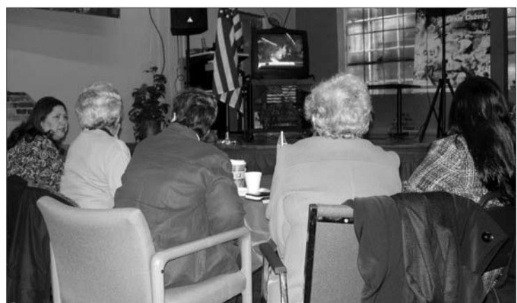
As people listened to Obama's inaugural speech, they remained upbeat about the future of the nation. Political observers say Obama is entering the presidency during one of the nation's worst economic upheavals in history.

Ayala caminó diez millas para llegar hasta el acceso del mall.