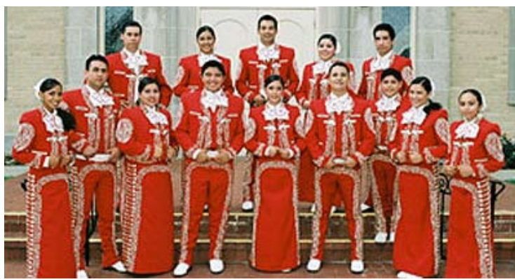
You will know when you hear the sounds of Mariachi Luna y Sol that the Cinco de Mayo celebration is in full gear. There will be plenty of food and dancing for the many that will step out to celebrate.