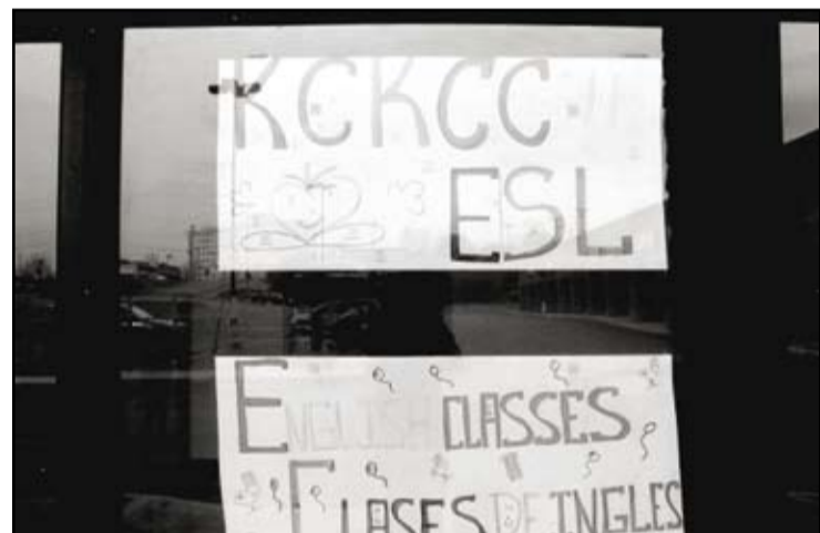
With the growing immigrant population in Kansas City, Kansas, the importance of learning the English Language is what driving the adult student to ESL Classes at KCKCC.

According to Lischka, ESL classes were being offered before she came to work at the college in 1987. "On campus we have a credit course of English as a Second Language and it is designed for the students who are taking college credit courses. The On Track Program classes are the adult continuing education program that has classes designed for people who want to improve their life skills.