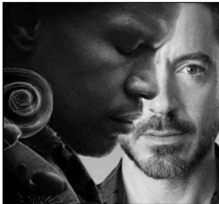
In "The Soloist" Robert Downey Jr. (left) befriends a homeless yet brilliant musician played by Jamie Foxx

The music of "The Soloist" is beautiful and compelling. As is the film that surrounds it.