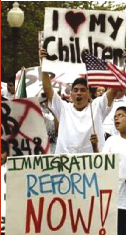
Organizers hope May Day rally draws hundreds this year as it did last year. (file photo)

Los organizadores esperan que la concentración del Día Internacional del trabajador atraiga a millones este año como lo hizo el año anterior. (foto de archivo)