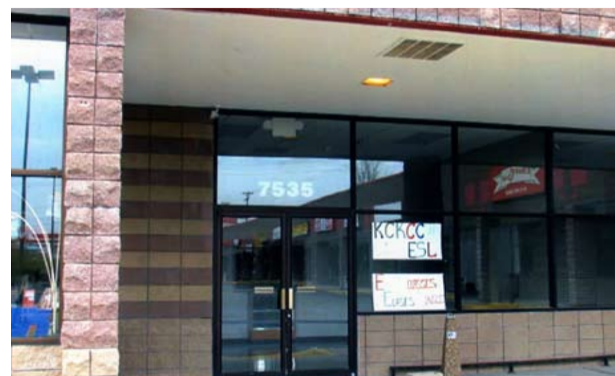
The growing need for Latinos/Hispanic to learn English is what has KCKCC offering ESL classes. Not only is it free of charge but it is also convenient for students to get to at the West State Plaza in KCK.

Nueva Localización para Programa de ESL del Colegio Comunitario de KCK