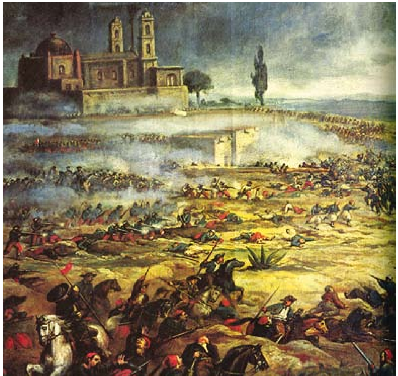
The battle of Puebla, Mexico 1862