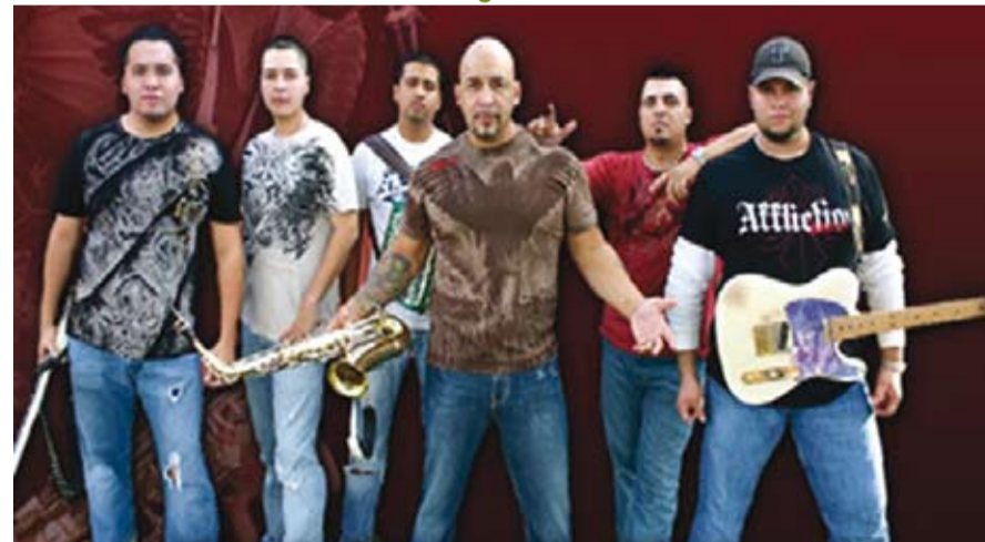
Grupo Viva kicks off this year's Cinco de Mayo at GCI with a free concert. Grupo Viva empieza la celebración del Cinco de Mayo en el GCI con un concierto gratis.