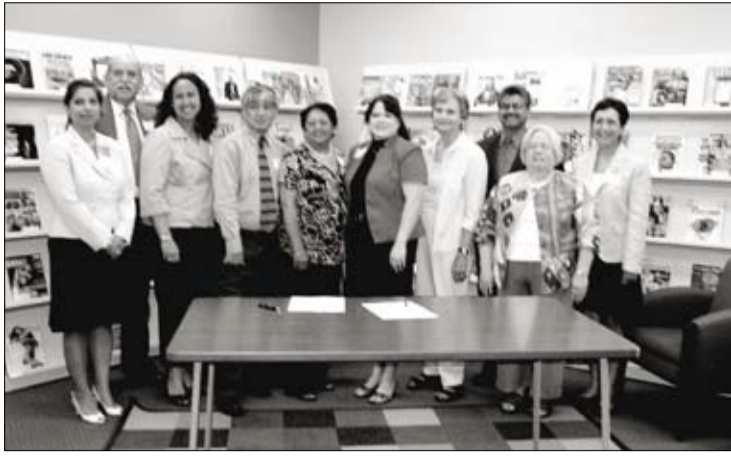
HEDC board members have joined officials of the Johnson County Library system to provide business services to Spanish speaking entrepreneurs.

Miembros de la junta de HEDC se han sumado a oficiales del sistema de Bibliotecas del Condado de Johnson para proveer servicios de negocios a empresarios de habla hispana.