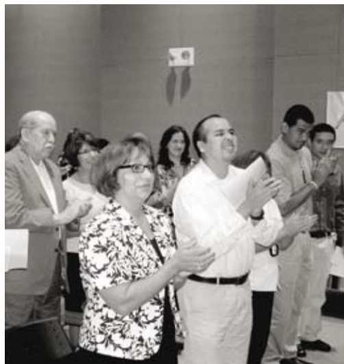
Civic and community leaders come together to witness the signing of the memorandum. Afterward, the agreement received a round of applause.