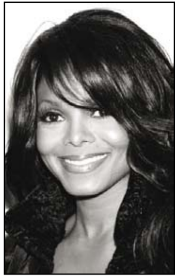
Janet Jackson said her brother Michael Jackson was an icon to the world but to her, he will always be family.

She said losing two icons of the 1970s on the same day was tough. Earlier in the day, Farrah Fawcett, an actress whose