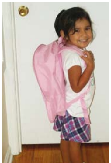
One safety tip is if children are alone in the afternoons, teach them to go straight home from school, keep the doors locked and not answer the door for anyone.

• Do not keep firearms easily accessible in your home and talk to kids about the potential dangers of guns and what to do if they find one. If you