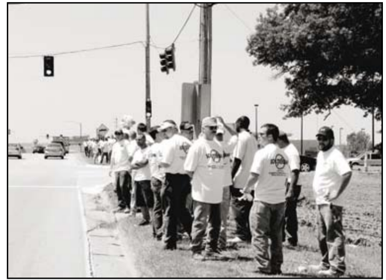
Local contractors and members of area unions wanted to make sure Schlitterbahn got their message that local union workers are available here in the metro.

"We use local union and non-union labor. We used union and non-union employees. We paid prevailing wage and we used local businesses for supplies and services. There has been no pub-