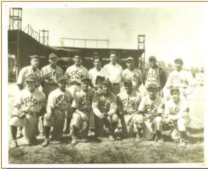
Mexican American baseball teams where a big part of the cultural landscape of the growing area Latino community. Aztecas were a Kansas City, Kansas club team and one the oldest in the area.